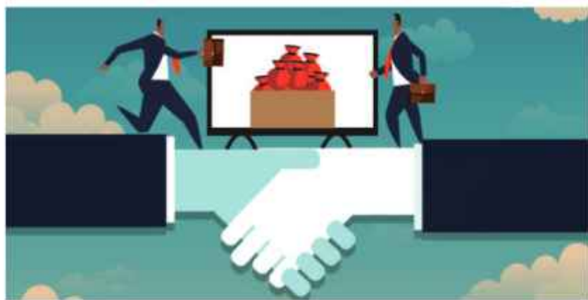
ILLUSTRATION: BINAY SINHA

"The merged Voot/JioCinema/Hotstar/Jio TV would have 184 million unique visitors (unduplicated for June 2024)," says Atul Nandoskar, sales director, Comscore India. That is a little under half the reach of India's largest OTT - YouTube.